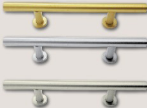
Cabinet Pull Round Bar Size : 5"-7"-9"-12"-15"-19"-24"