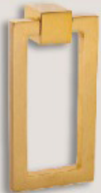
BRUSH BRASS Size : 4" X 2"