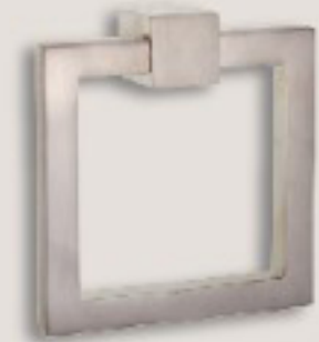
SATIN NICKLE Size : 2" - 3" - 4"