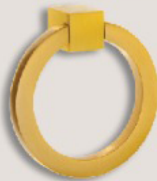
BRUSH BRASS Size : 2" - 3" - 4"