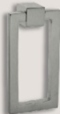
SATIN NICKLE Size : 4" X 2"