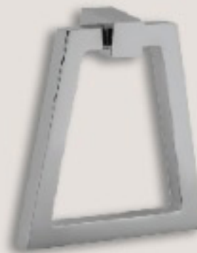
SATIN NICKLE Size : 3" X 4" X 2"