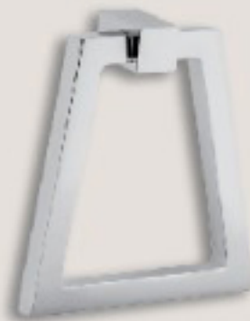
CHROME Size : 3" X 4" X 2"