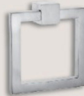
CHROME Size : 2" - 3" - 4"