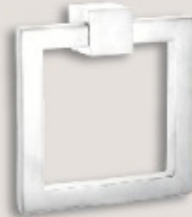
POLISHED NICKLE Size : 2" - 3" - 4"