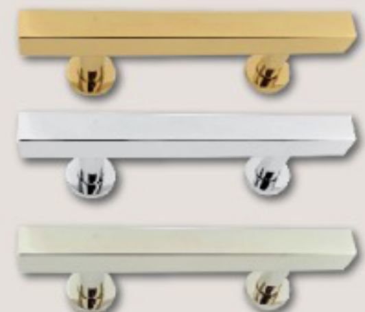
Cabinet Pull Square Bar Size : 5"-7"-9"-12"-15"-19"-24"

Product Colour and Finish may slightly vary due to photographic lighting sources.