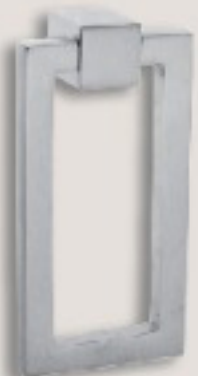
CHROME Size : 4" X 2"