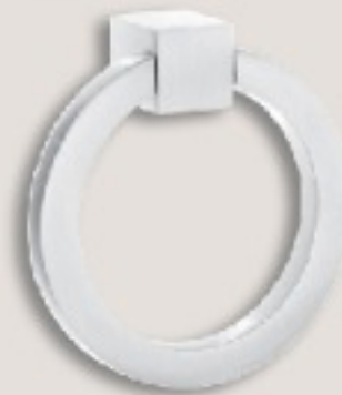
CHROME Size : 2" - 3" - 4"