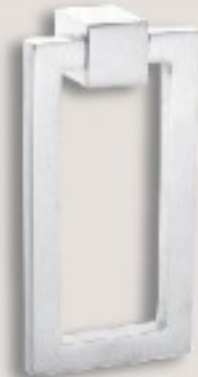
POLISHED NICKLE Size : 4" X 2"