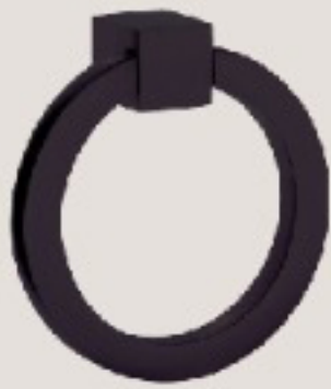
MATTE BLACK Size : 2" - 3"