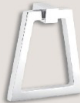
POLISHED NICKLE Size : 3" X 4" X 2"