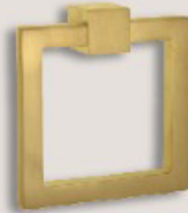
BRUSH BRASS Size : 2" - 3" - 4"