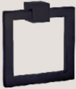
MATTE BLACK Size : 2" - 3"