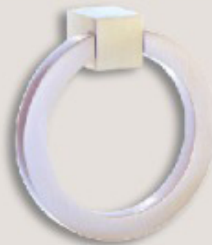
POLISHED NICKLE Size : 2" - 3" - 4"