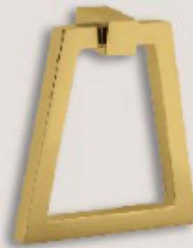
BRUSH BRASS Size : 3" X 4" X 2"