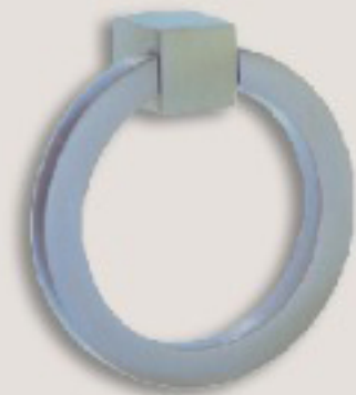
SATIN NICKLE Size : 2" - 3" - 4"